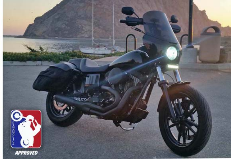
Chrome Megaphone Muffler Version shown Part# 1D12R Drag# 1800-1305 $729.95