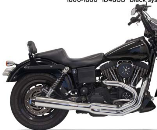
4" Straight Can Version Shown