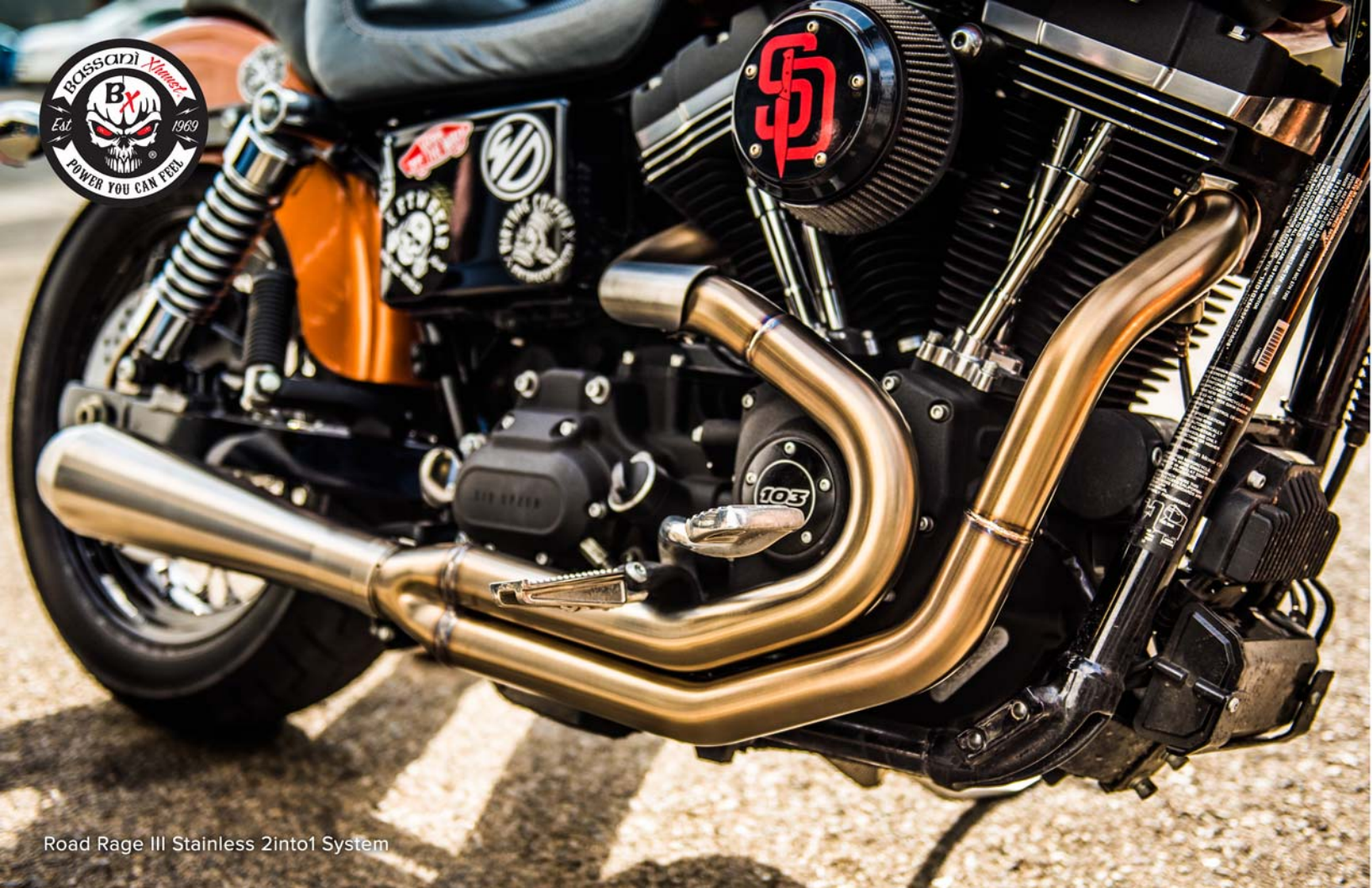
Road Rage III Stainless 2into1 System