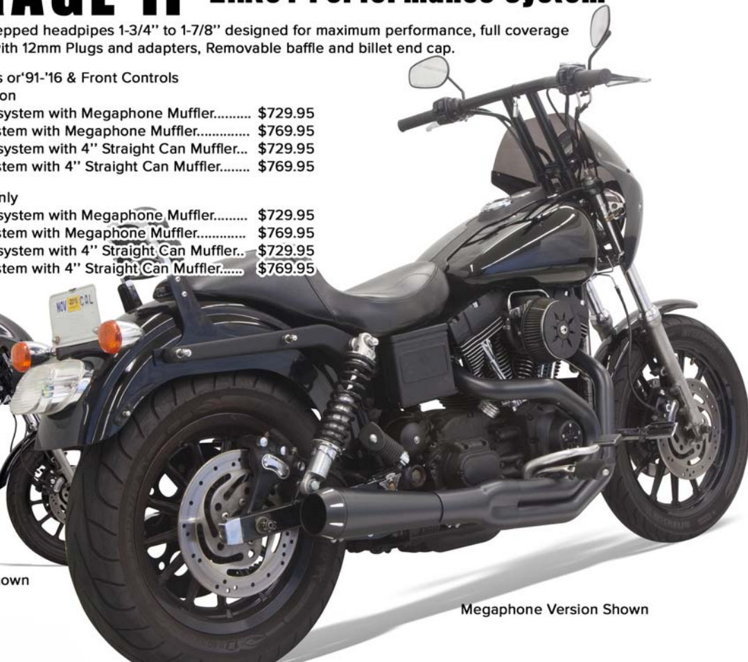
Megaphone Version Shown